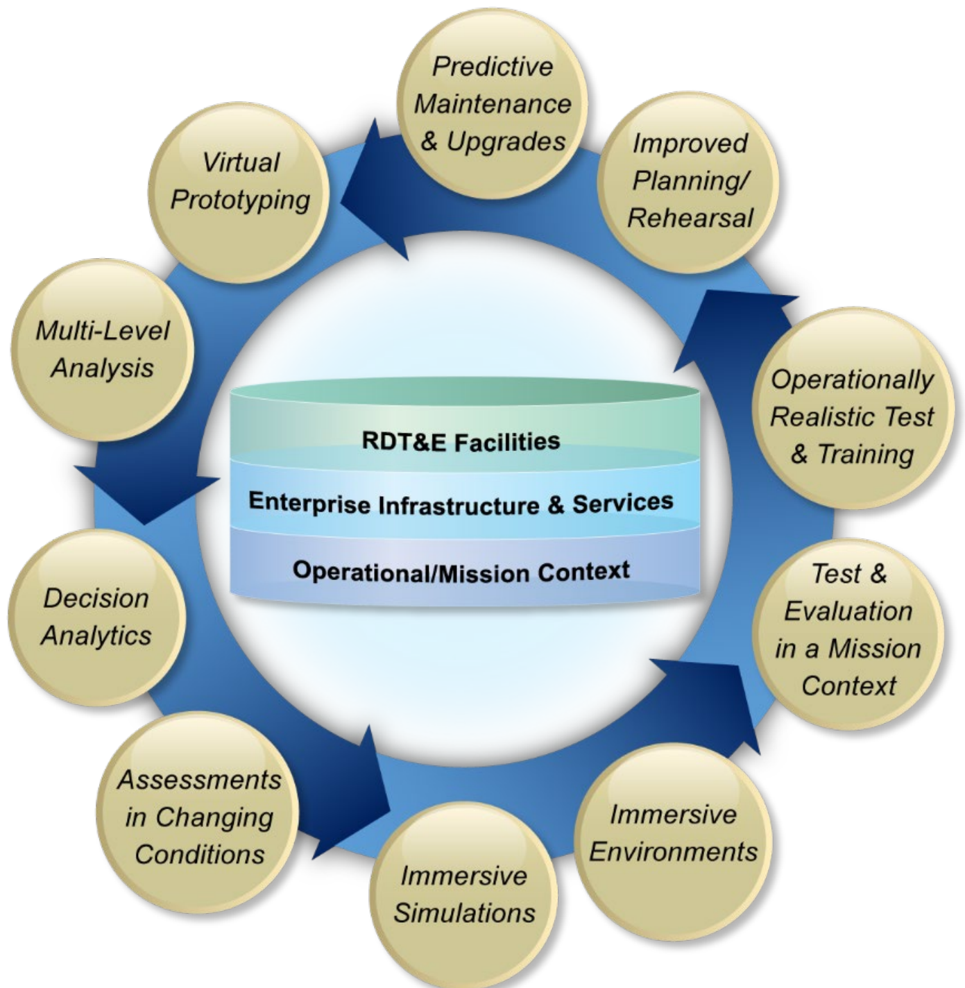
Figure 3. Shared Capability Across the Acquisition Life Cycle

One very tangible benefit of this evolution will be the ability to conduct SoS testing, an essential requirement to support evaluation of concepts, such as Joint All-Domain Command and Control (JADC2), in the context of all-domain operations. Given the